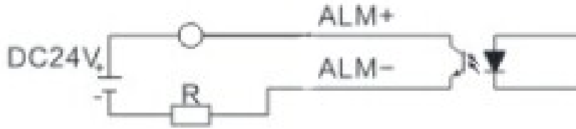
Alarm in place output wiring diagram